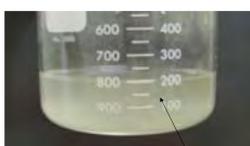
Water remaining in cryostat after failed attempt at forming an ice blockage